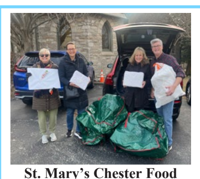
Cupboard & White Gifts St. Mary's volunteers delivered large bags of donated food and Christmas "White Gifts" to St. Mary's Episcopal Church and the community of Chester, PA.