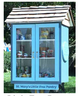
Little Free Pantry Our little free pantry is very well supported and used by the community and continues to be a blessing to many by providing nonperishable items to the community of Wayne, 24/7.