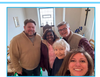
St. Gabriel's Christmas Meals St. Mary's provided 50 very full bags containing the makings for a beautiful Christmas meal and a $25 grocery gift cards to supplement.