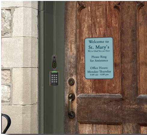
Artist Rendering of Proposed Installation & Signage