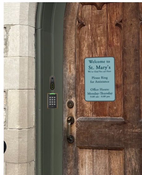
Artist Rendering of Proposed Installation & Signage

Parish Hall Access Control System Installation Vestry has voted to accept a proposal by i Touch AVS Systems to install an Alarm.com access control system and doorbell cam to the main door of the Parish Hall. This system will add an electronic door strike to the latch, which will allow the main Parish Hall to be unlocked remotely, with keypad codes, mobile credentials and also within scheduled time windows. The goal is to increase access to the Parish Hall for the community while improving security when it is empty or understaffed. All keyholders can continue to use their keys until the new system is fully implemented and we get accustomed to using it. You may contact Bob Mickel at robertmickel27@gmail.com with questions.