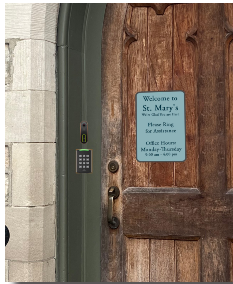
Artist Rendering of Proposed Installation & Signage

Vestry has voted to accept a proposal by i Touch AVS Systems to install an Alarm.com access control system and doorbell cam to the main door of the Parish Hall. This system will add an electronic door strike to the latch, which will allow the main Parish Hall to be unlocked remotely, with keypad codes, mobile credentials and also within scheduled time windows. The goal is to increase access to the Parish Hall for the community while improving security when it is empty or understaffed. All keyholders can continue to use their keys until the new system is fully implemented and we get accustomed to using it. You may contact Bob Mickel at robertmickel27@gmail.com with questions.